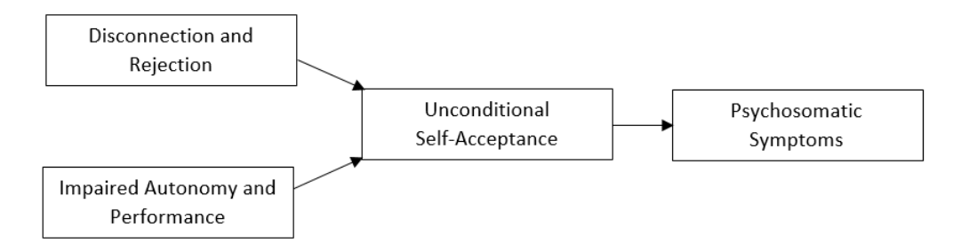
Figure 1. The theoretical model of the relationships among early maladaptive schemas, unconditional self-acceptance, and psychosomatic symptoms.

example, one study found that EMSs are associated with symptomatology, which included psychosomatic symptoms, and that mindfulness, unconditional self-acceptance, and self-compassion mediated the relationship between EMSs and symptomatology (Faustino et al., 2020). Similarly, another study investigated EMSs more closely, through including EMSs on a domain level and in the relationship between the EMS domains of Disconnection and Rejection, Impaired Autonomy and Performance, Impaired Limits, Other-Directedness and Overvigilance and Inhibition with symptomatology, with cognitive fusion as an expected mediator, the study found that the composite model of the EMS domains Impaired Autonomy and Performance and Other-Directedness with cognitive fusion as a mediator was significant, and accounted for 52% of the variance (Faustino & Vasco, 2019). As of yet, however, there has been no study that has investigated unconditional self-acceptance as a mediator in the relationship between specific EMS domains and psychosomatic symptoms, which is the aim of the present study (See Figure 1).